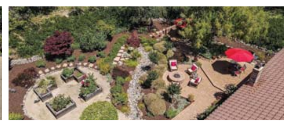
MORAGA | $1,695,000

Located in desirable Campolindo, this 3 bedroom, 2 bath single-story home is set on a peaceful cul-de-sac offering a magical garden with paver patio, firepit & more.