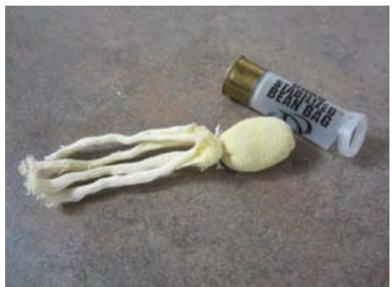
Bean bag projectiles